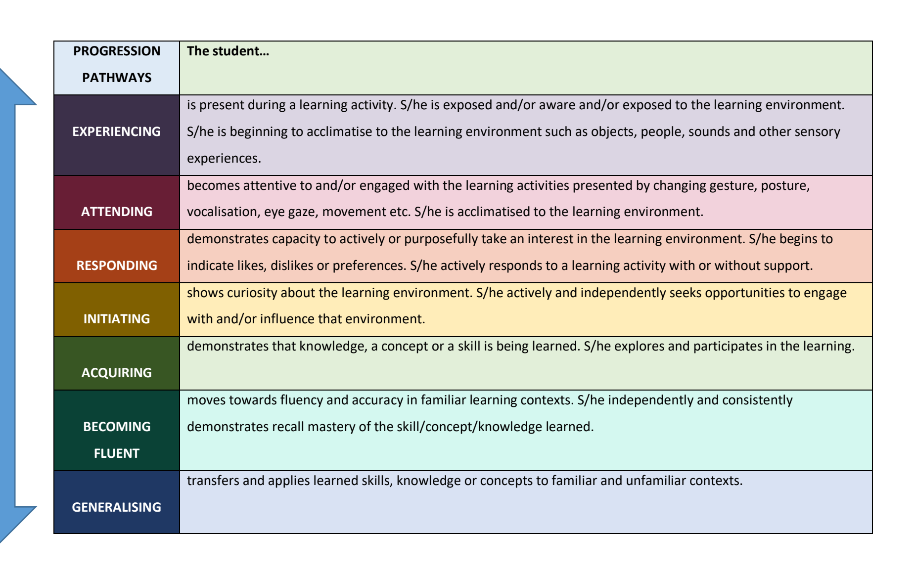
Figure 2: The progression continuum