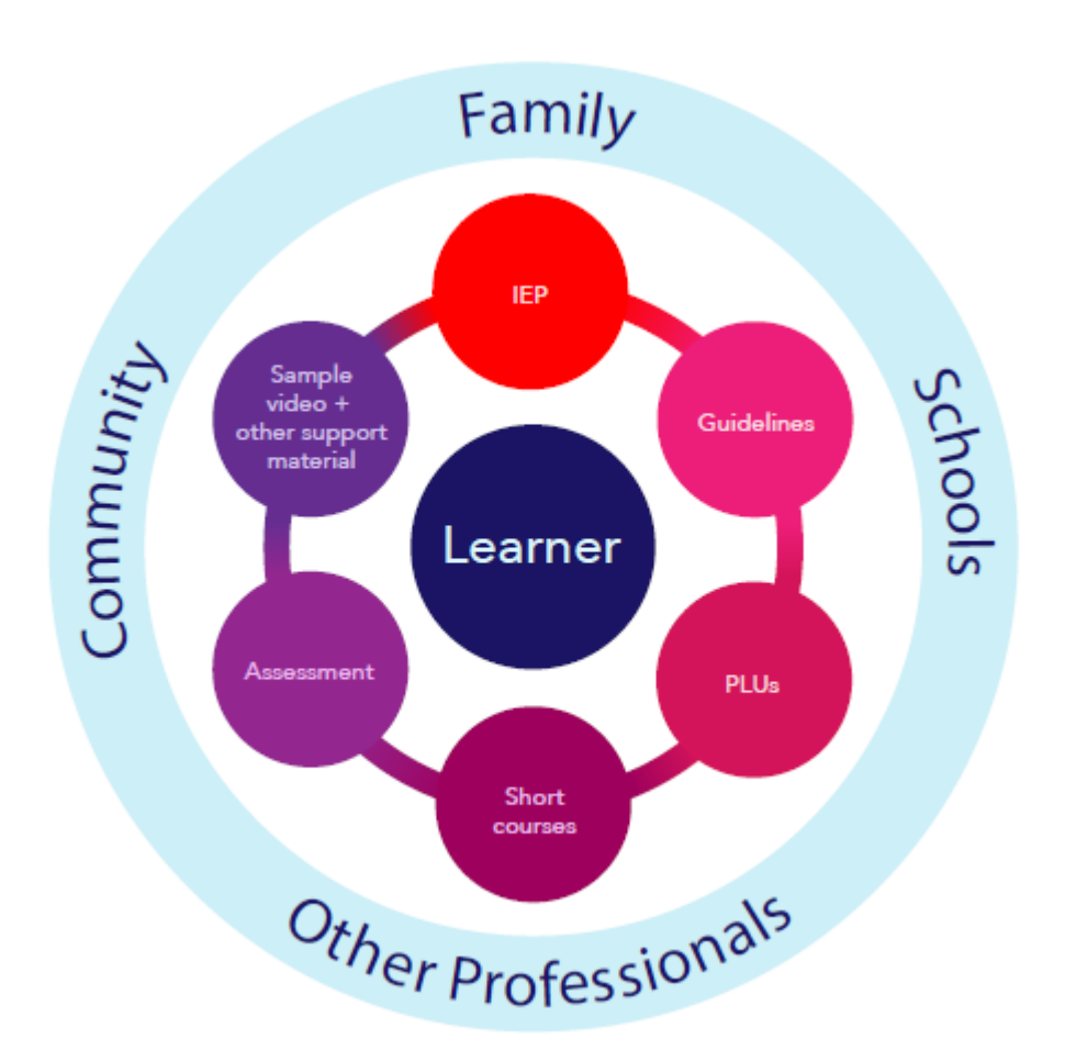
Figure 1: Supports for L1LP planning, teaching and assessment

See Figure 1 below for a visual representation of this process.