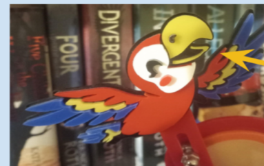
You can see here that the CAD was printed and glued in layers.

With all of my projects I was told that they were very creative and worked nicely, with my cam and slot I was told to have filed down the horses more