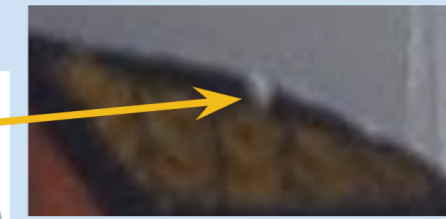
Example of cutting into the project with the scroll saw